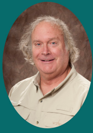
Oz Prim Yadkin Family YMCA